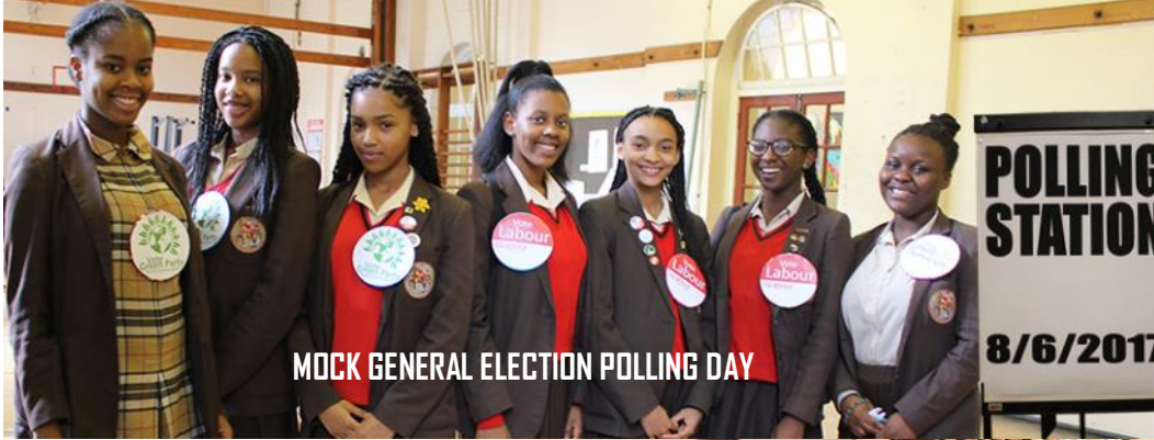
MOCK GENERAL ELECTION POLLING DAY