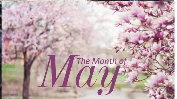
The Month of May