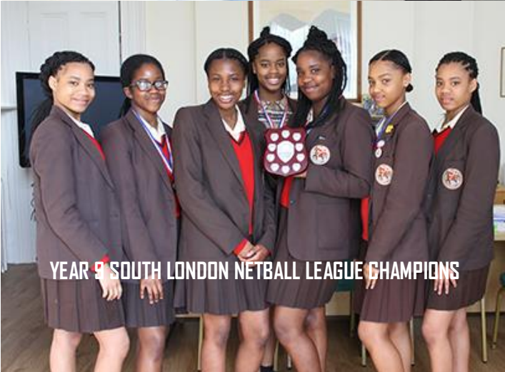
YEAR 9 SOUTH LONDON NETBALL LEAGUE CHAMPIONS