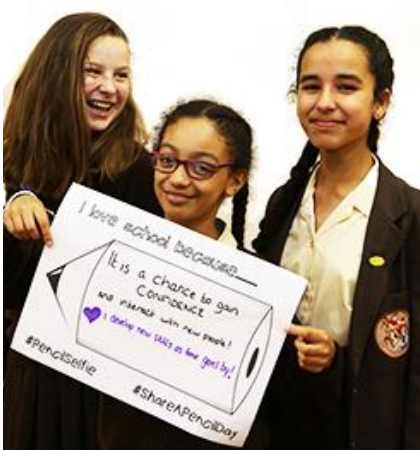
SHARE A PENCIL DAY @ ST MARTIN'S