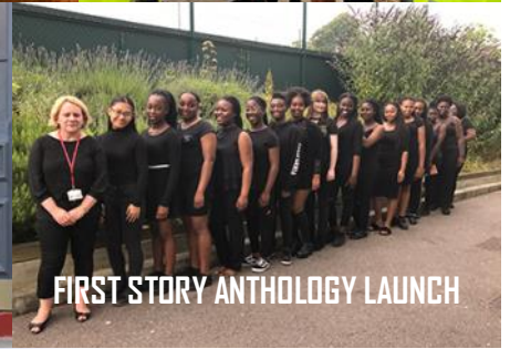
FIRST STORY ANTHOLOGY LAUNCH