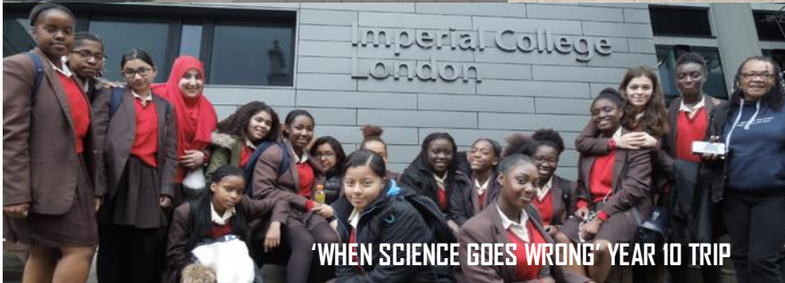
'WHEN SCIENCE GOES WRONG' YEAR 10 TRIP