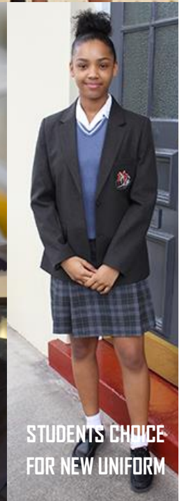
STUDENTS CHOICE FOR NEW UNIFORM