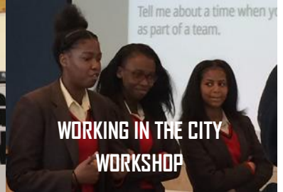
WORKING IN THE CITY WORKSHOP