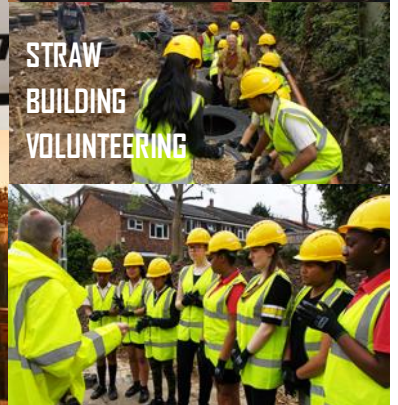
STRAW BUILDING VOLUNTEERING