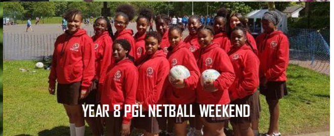
YEAR 8 PGL NETBALL WEEKEND