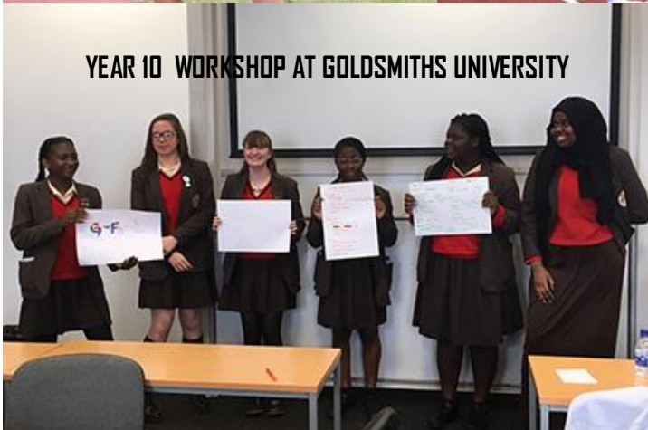
YEAR 10 WORKSHOP AT GOLDSMITHS UNIVERSITY