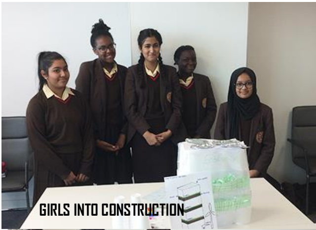
GIRLS INTO CONSTRUCTION