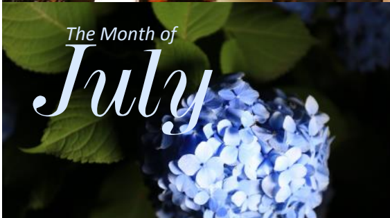
The Month of July