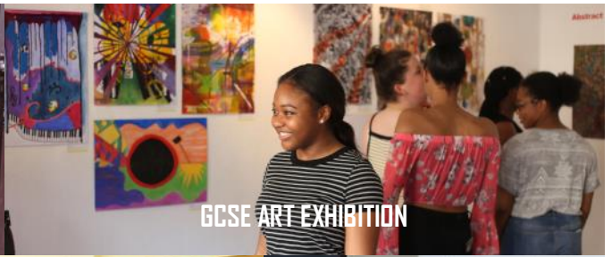
GCSE ART EXHIBITION