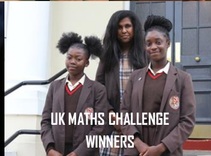
UK MATHS CHALLENGE WINNERS