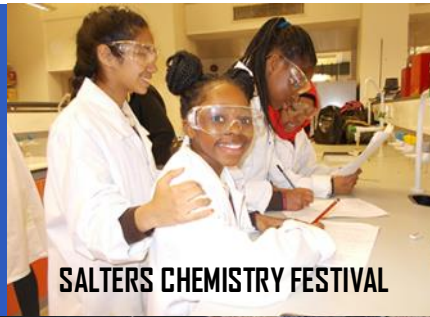
SALTERS CHEMISTRY FESTIVAL