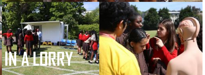
LAB IN A LORRY