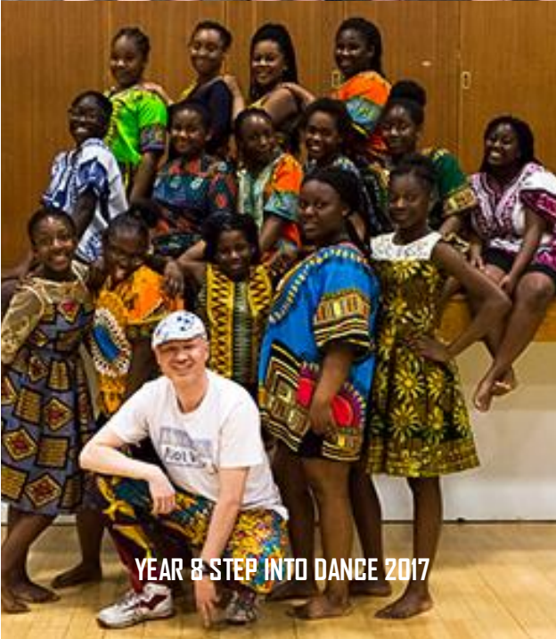
YEAR 8 STEP INTO DANCE 2017