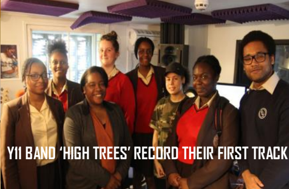
Y11 BAND 'HIGH TREES' RECORD THEIR FIRST TRACK