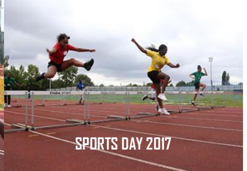
SPORTS DAY 2017