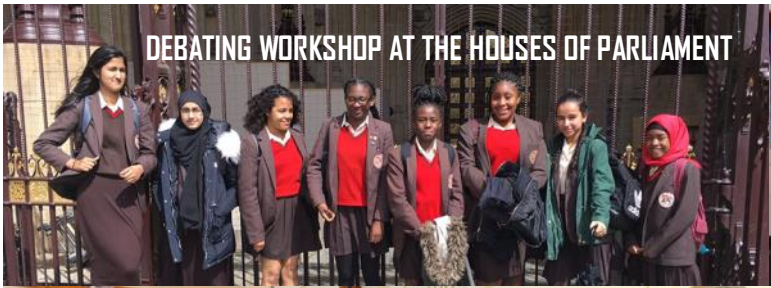
DEBATING WORKSHOP AT THE HOUSES OF PARLIAMENT