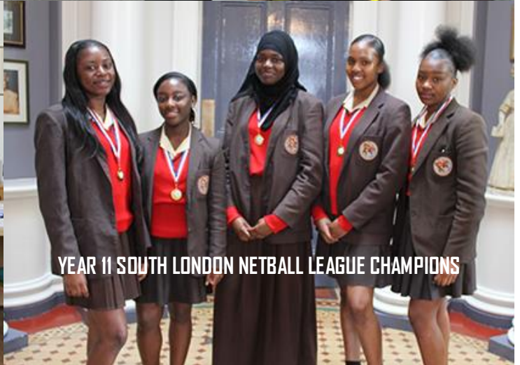
YEAR 11 SOUTH LONDON NETBALL LEAGUE CHAMPIONS